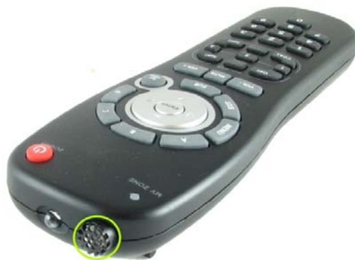
Figure 1: Remote with Ultrasonic Transducer integrated

With MyZone, an additional ultrasonic transducer is added to the system remote control. The listener initiates the MyZone calibration by holding the remote control at ear height and pushing the MyZone button at the desired listening location. The ultrasonic transducer in the remote produces an inaudible chirp, and all of the transducers in the speaker network listen and report back to the master the exact time they heard the chirp. The master uses this data to calculate the listener's position in X,Y space relative to the center speaker to within +/-2 in. (5.08. cm). The listener's actual position is then stored and updates the previously stored location in the room mapping equation. The system is auto-calibrated to the MyZone location upon each subsequent power up until a new MyZone location is set.