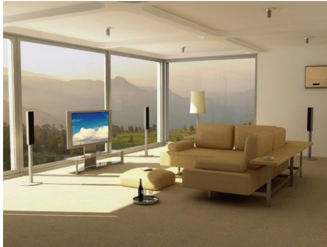
Figure 1: Modern Minimalist Décor Presents Wiring Challenges