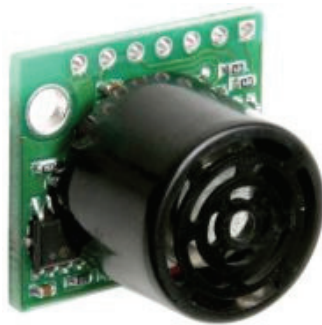
Figure 4: Ultrasonic Transducer

SpeakerFinder uses 40 KHz ultrasonic transducers integrated in the speakers to automatically map the location of each SpeakerFinder-enabled speaker within the room. At power up (or with a host processor command), the master module requests each speaker to sequentially “chirp” its ultrasonic transducer in a round-robin fashion. When one speaker chirps, the others listen, determine exactly when they heard the chirp, and wirelessly report the information back to the master system. In turn, each of the remaining speakers chirp, and the master builds a cube of data that has the time-of-flight information between all of the speakers. Through mathematical algorithms, the FS848 calculates the angle and distance between all of the speakers to within \pm 1 in. ( \pm 2.54 cm) accuracy.